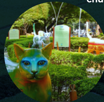
The riverside Cat Park