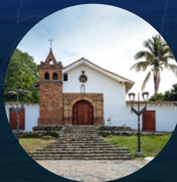
San Antonio historical neighbourhood

Cali, known as the “World Capital of Salsa” and the third largest city in Colombia, is a vibrant and lively tourist destination that offers a wide range of unique experiences, sounds and flavours.