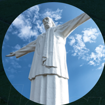
Cristo Rey monument