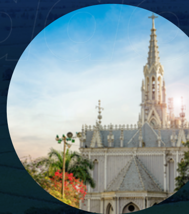
La Ermita church