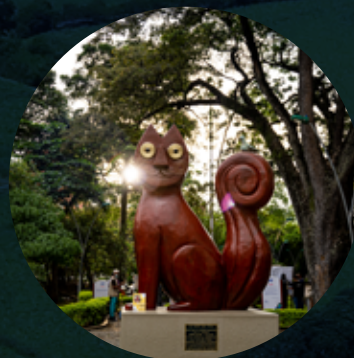
The River Cat sculpture